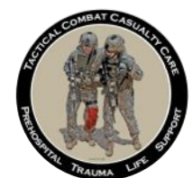
Tactical Combat Casualty Care (TCCC) & Law Enforcement & First Response Tactical Casualty Care (LEFR-TCC)