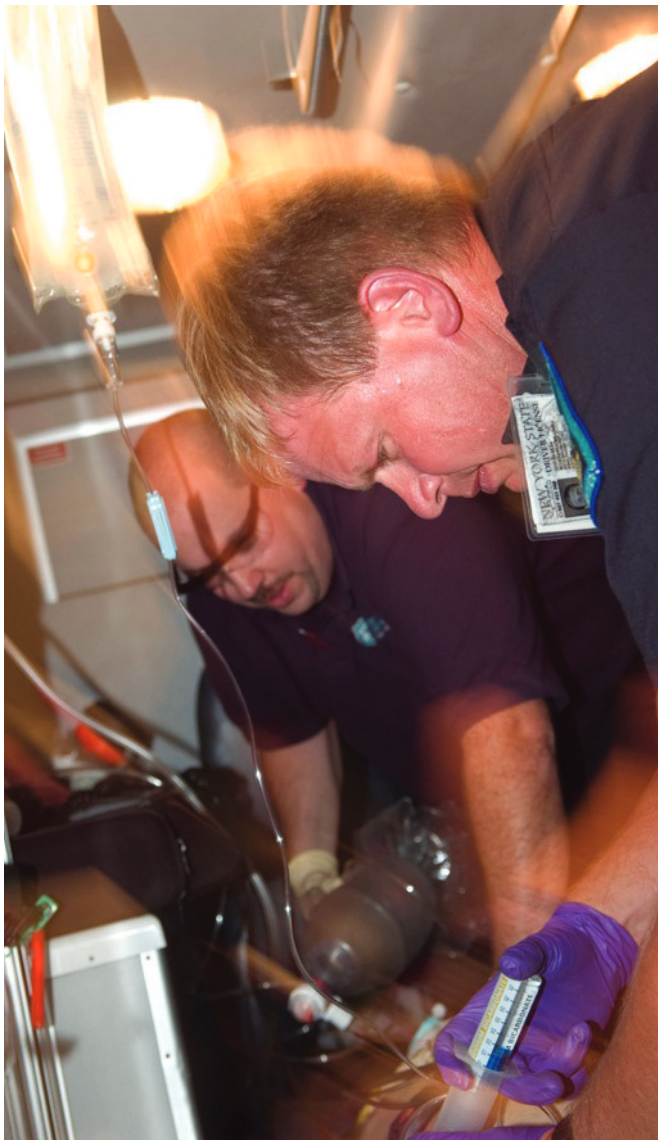
Research in resiliency training has shown successful readjustment diminishes the risk of developing posttraumatic stress disorder.

from 1990–2010, researchers reviewed 1,787 deaths of active and retired Chicago Fire Department (CFD) members, identifying 41 completed suicides. Each death was a male with an average age of 55. In addition, researchers determined the likelihood of an active or retired CFD member committing suicide was 25 times greater than the general population (10–12 suicides per 100,000 in general population versus 25 suicides/10,000 for the CFD cohort). 1 Further, work-related stress has been associated with mental health problems and the prevalence of posttraumatic stress disorder (PTSD) appears to be much higher for first responders than for the general population. Some startling data suggests that first responders live 15 years less than the “civilian world.”