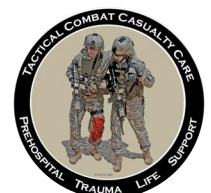
Tactical Combat Casualty Care (TCCC) & Law Enforcement & First Response Tactical Casualty Care (LEFR-TCC)