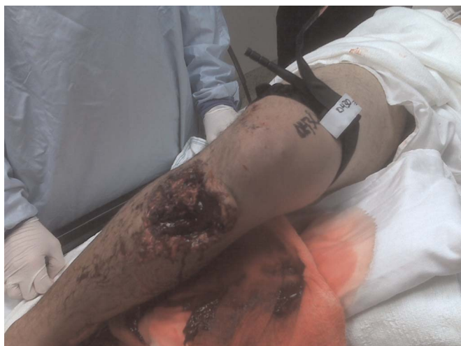
Figure 5. Limb injury with major vascular injury, tourniquet conversion or tourniquet replacement not attempted as rapid transport to hospital was possible.