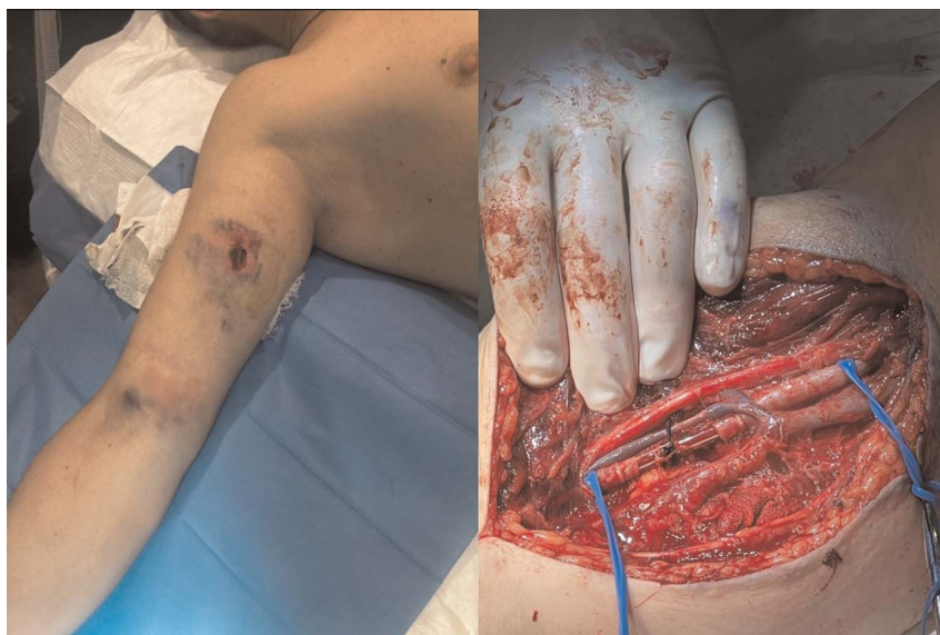
Figure 4. Limb injury with major vascular injury and 5-hour tourniquet use, with brachial artery injury and shunt in place. The tourniquet was just above the wound and likely not amendable to tourniquet conversion or tourniquet replacement.

benefit, however as stated above, most recommendations state that TC/TR can only be done by medical personnel. This scenario is actively occurring in Ukraine and resulting in potentially preventable complications. 20,21 What is being witnessed is a repetition of a lesson not learned from WWII, which resulted in tourniquets not being used appropriately for 60 years.