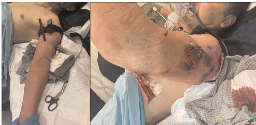
Figure 2. Limb with minimal injury but a 5-hour tourniquet use, requiring fasciotomy. Tourniquet conversion was indicated.