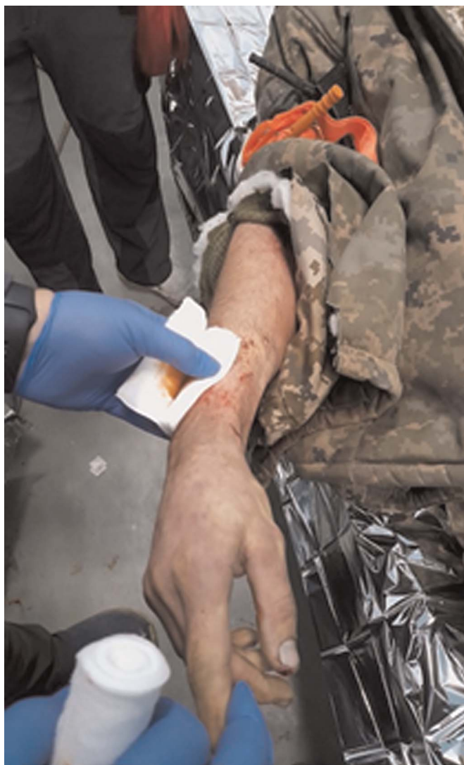
Figure 3. Limb with minor injury. The only wound was minor shrapnel injury of the soft tissues of the back surface of the right forearm (under the gauze dressing). The tourniquets were applied around 11:00 AM. There was no qualified medic nearby who knew what to do with the tourniquets. Evacuation during the day was impossible due to heavy artillery shelling, and the casualty arrived to the stabilization point at 10:30 PM (11.5 hours tourniquet time). There were no signs of massive bleeding, the patient was stable and awake and alert. A detailed examination revealed no other injuries. The right upper limb was cold, there was no distal pulse, there was no sensitivity, there were no active movements, and passive movements were significantly limited. The casualty underwent an amputation. Tourniquet conversion was indicated.

In summary, most tourniquet applications in the prehospital setting can have safe conversion, and almost all can safely have replacement at a lower level on the limb (Table 1).